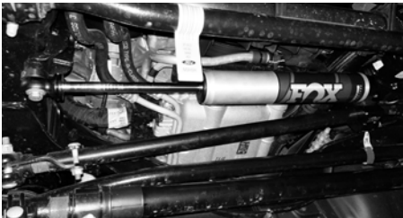
Fig. 3: TS stabilizer clamped to drag link