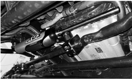
Fig. 2: Stabilizer clamped to drag link