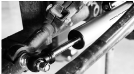
Fig. 3: Eyelet installed on track bar bolt