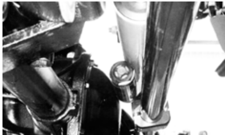
Fig. 5: 135 degree reservoir orientation on some 2012 and newer applications