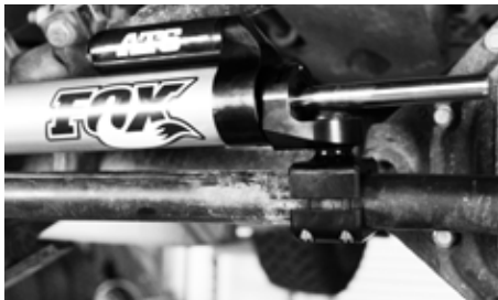
Fig. 4: Stabilizer loosely clamped to tie rod