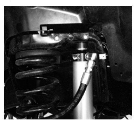
Fig. 2: Driver Side