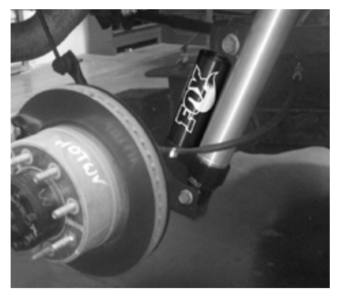
Fig. 3: Passenger Side