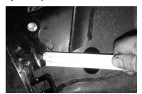
Fig. 4 - Passenger Side