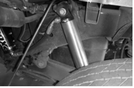
Fig. 3 - Passenger Side