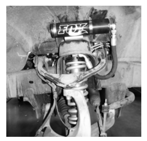
Fig. 2: Passenger side