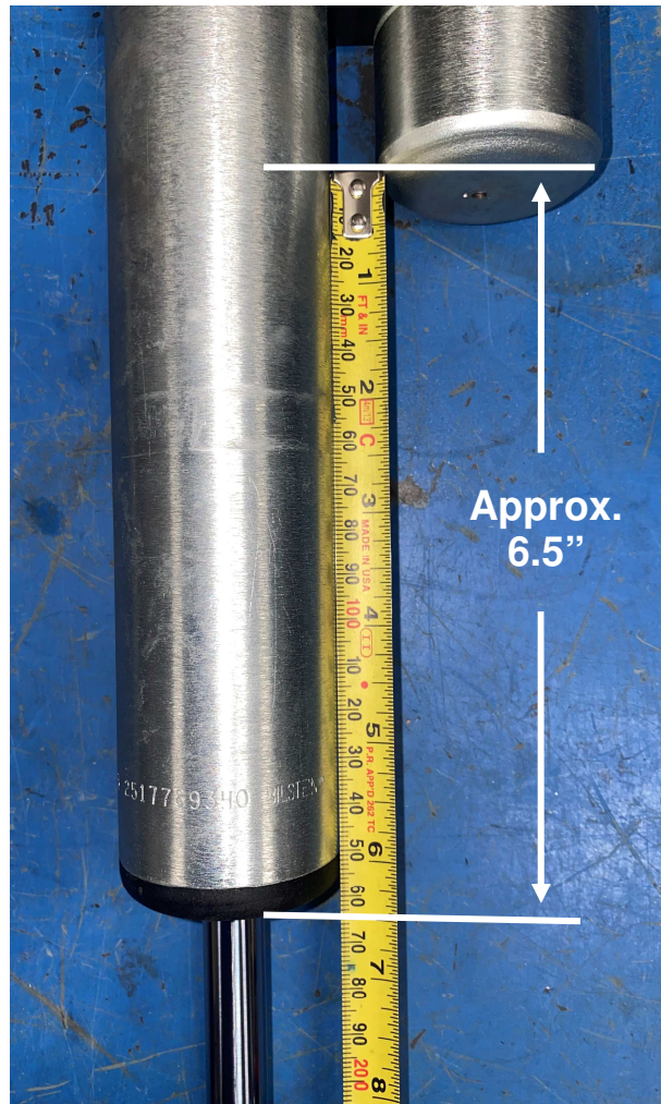
Figure 4. Passenger Side