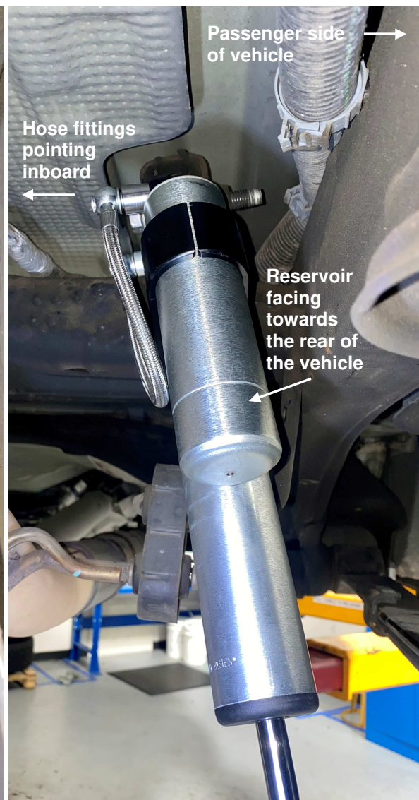
Figure 6. Passenger Side (Rear View)