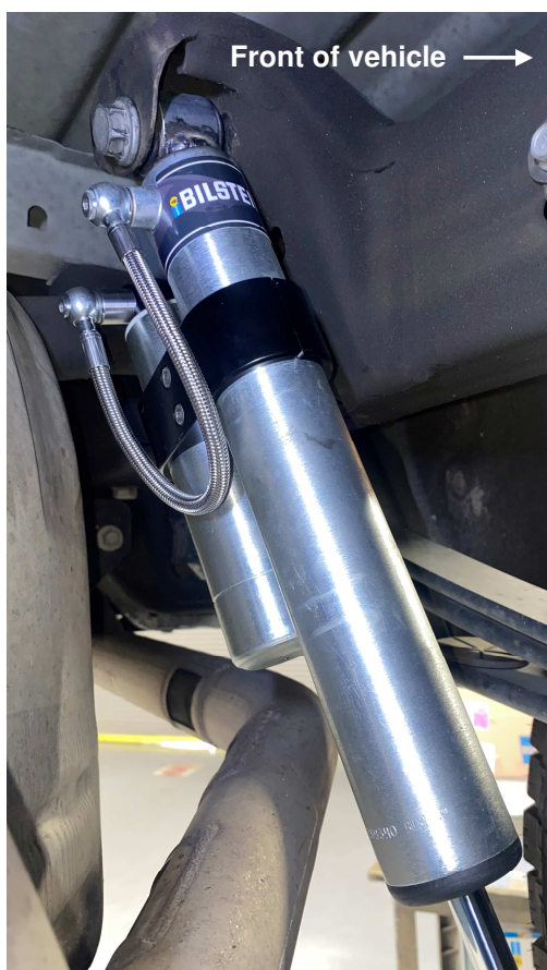
Figure 1. Driver Side