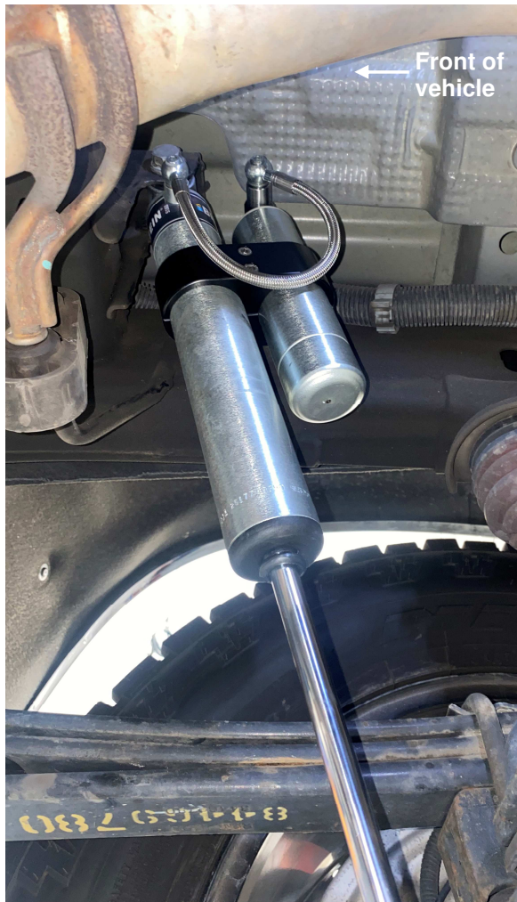
Figure 3. Passenger Side