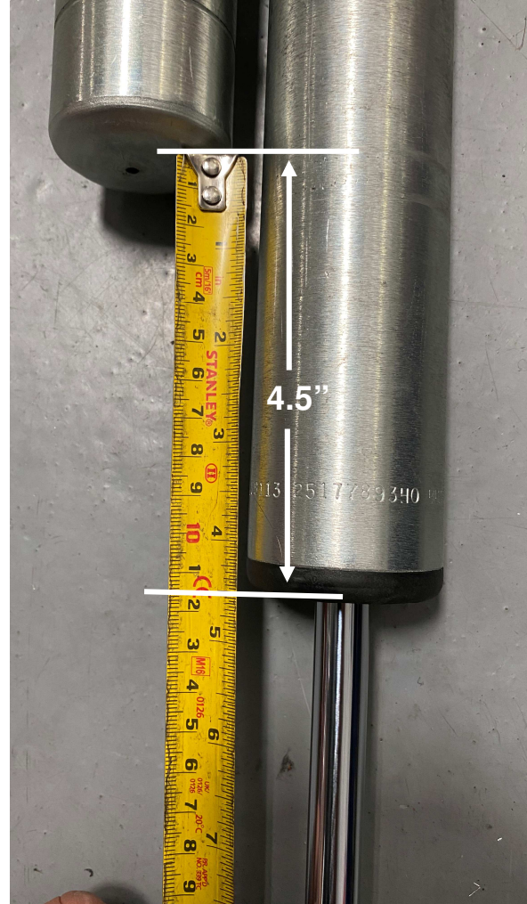
Figure 4. Passenger Side