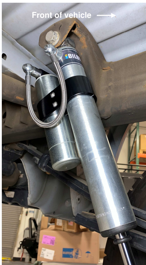
Figure 1. Driver Side