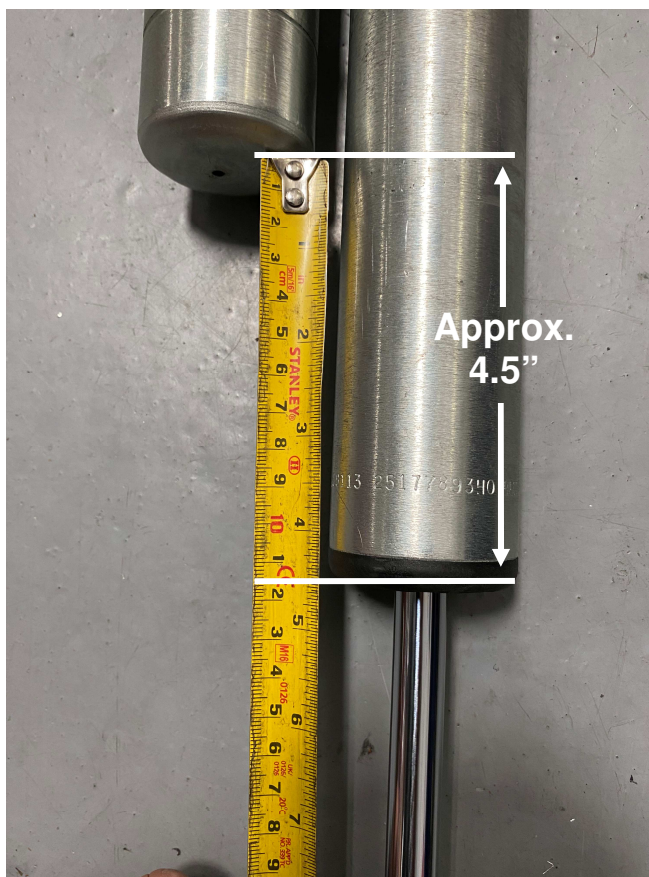
Figure 2. Driver Side