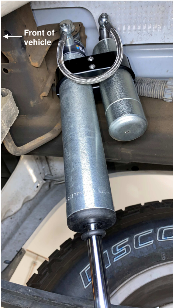
Figure 3. Passenger Side