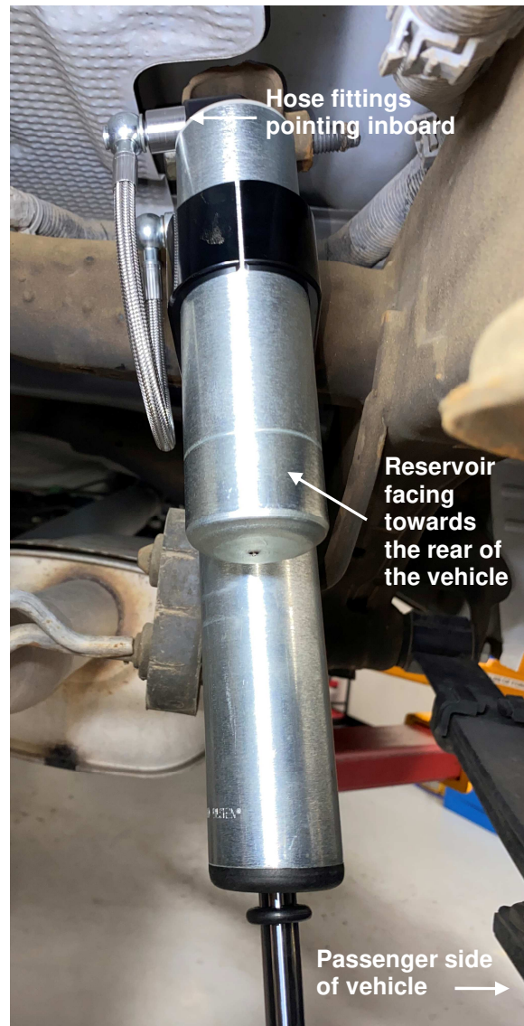
Figure 6. Passenger Side (Rear View)