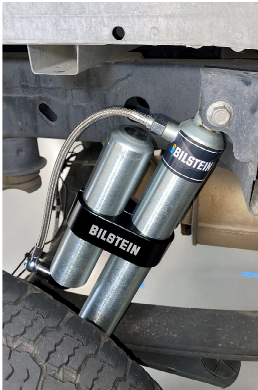
Figure 3: Rear passenger side