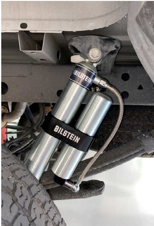
Figure 1: Rear driver side