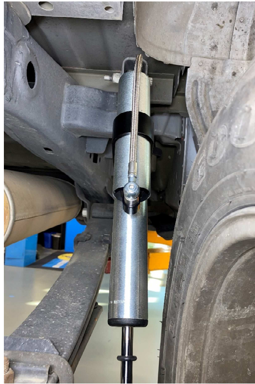
Figure 4: Rear passenger side