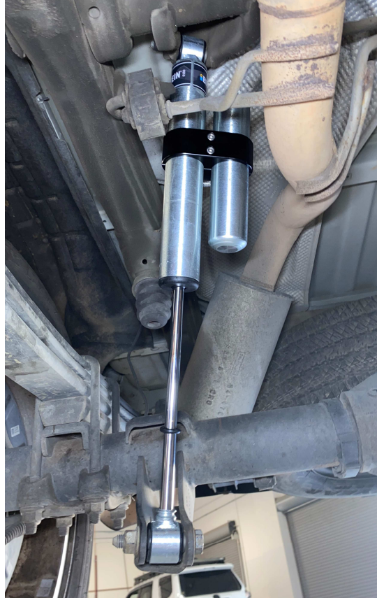
Figure 3. passenger side (rear view)