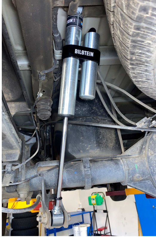
Figure 1. driver side