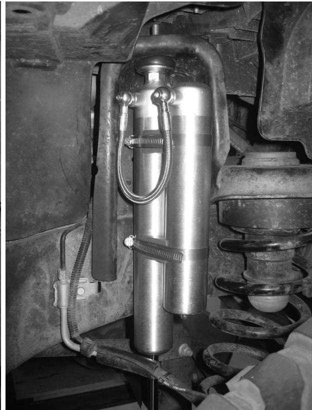
Figure 2. front passenger side