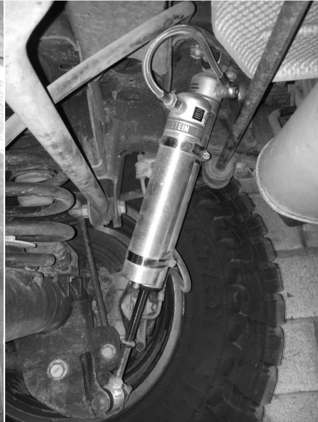
Figure 4. rear passenger side

(Note the swivel banjo on the shock body is facing to the rear of the vehicle. Improper installation will cause damage to the swivel banjo and may cause leaking.)