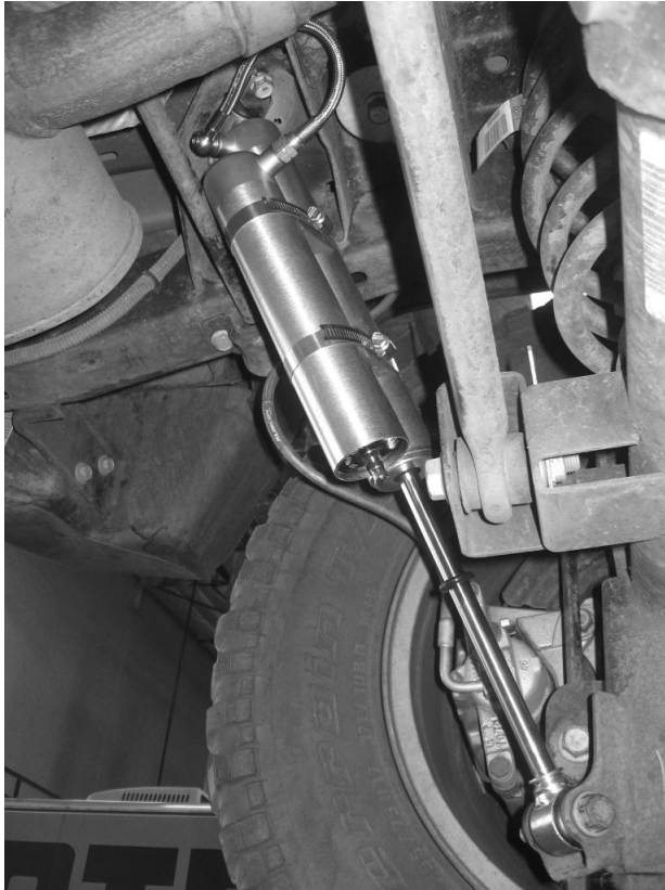
Figure 3. rear driver side