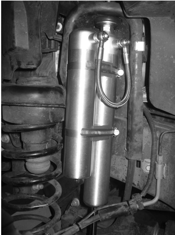
Figure 1. front driver side