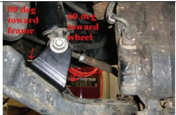
Install new extension bracket with OE bolts as shown

Reinstall wheels/tires and torque. Recheck all work performed and test drive vehicle. Note: Initial height can now be set. Final adjustments of the torsion bars may, and should be performed by the alignment shop.