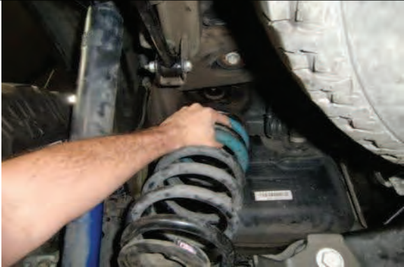
Carefully lower axle and remove coil springs and isolators