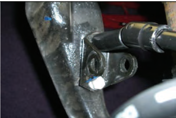
66-3050 shock extensions will replace the OE brackets