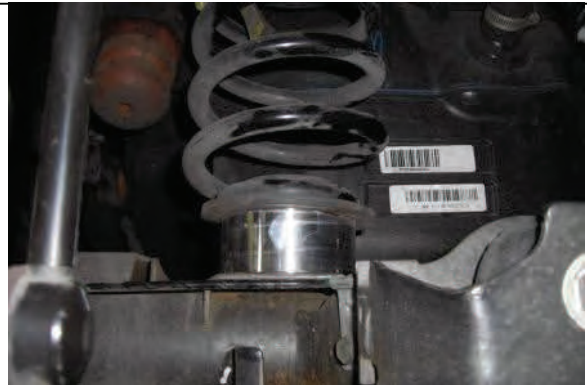
Reinstall coil spring and seat on top of spacer, raise axle.

Reconnect rear shocks and sway bar end links, Reattach all brackets and ABS lines in their original locations and recheck all work. Replace wheels/tires lower vehicle and torque to spec. Test drive vehicle.