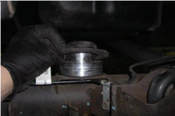
Refit OE rubber isolator on top of billet spacer