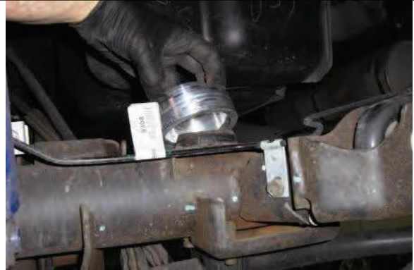
Place ReadyLIFT spacer on axle mount