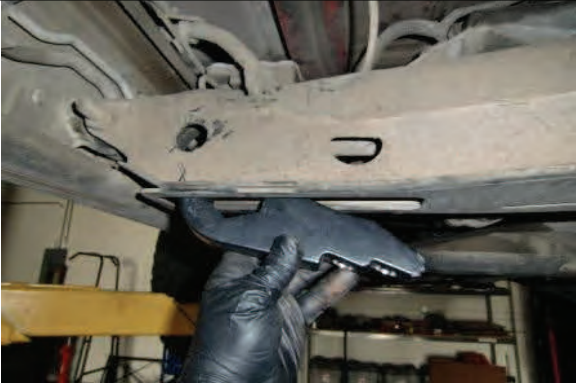
Install new ReadyLIFT forged torsion key in same position.