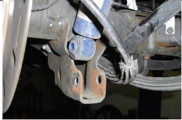
Disconnect Lower shock mounts