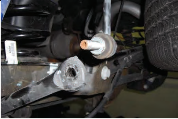
Support axle with jack and disconnect sway bar end links