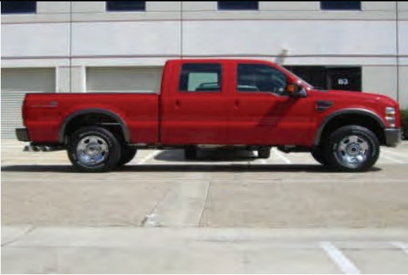
Position vehicle on level ground with steering wheel straight