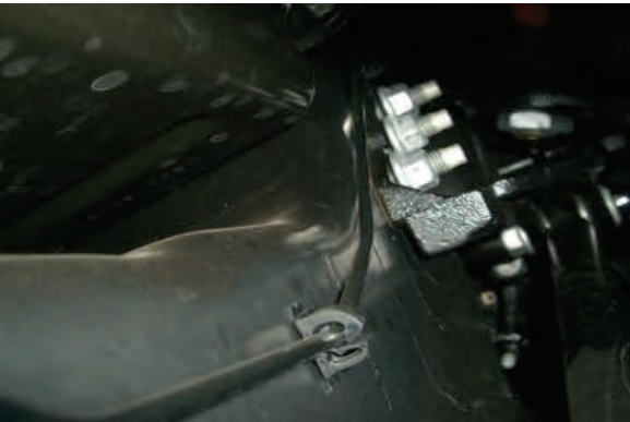
Remove (3) mounting nuts on cross member

Remove and replace bracket with new one in reverse order. It may be necessary to move the vehicle side to side in order to reattach trac bar in the new bracket. This can be done by starting the vehicle and carefully moving the steering wheel. Make sure to properly torque all hardware to factory spec. Have vehicle aligned.