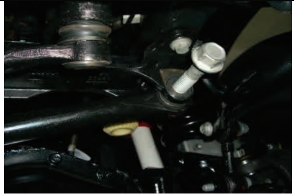
Remove upper trac bar hardware at frame