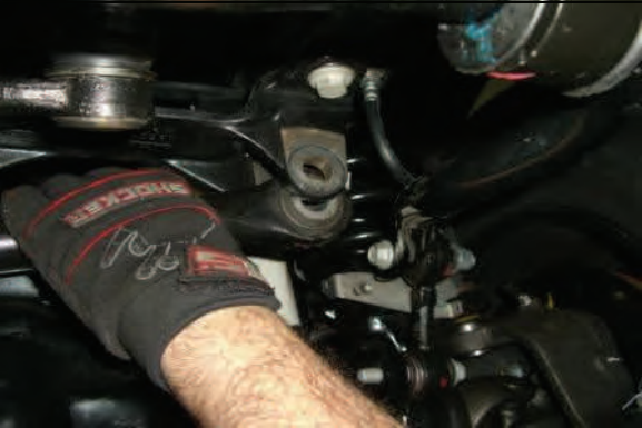
Pull down trac bar or use pry bar to disconnect