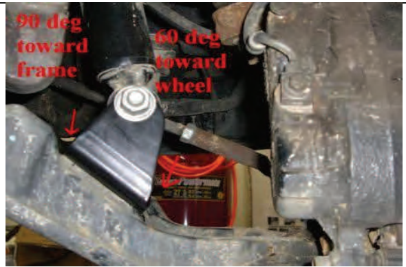
Install new extension bracket with OE bolts as shown

Reinstall wheels/tires and torque. Recheck all work performed and test drive vehicle. Note: Initial height can now be set. Final adjustments of the torsion bars may, and should be performed by the alignment shop.