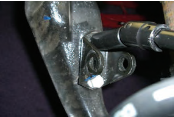
66-3050 shock extensions will replace the OE brackets