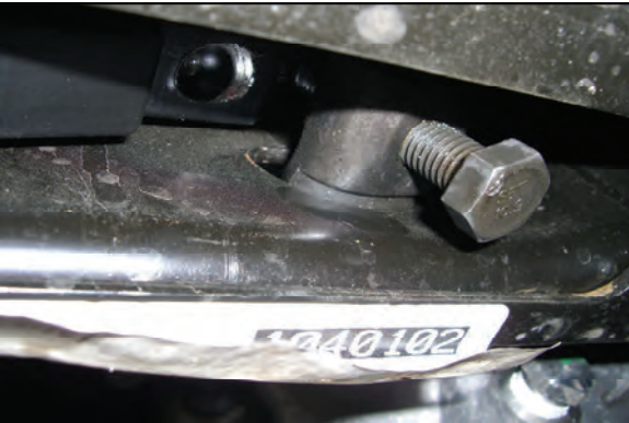
Install new adj. bolt and make bolt flush with cross-member