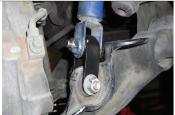
66-3000 Install front lower shock extensions and hardware