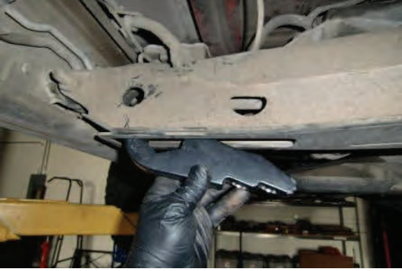
Install new ReadyLIFT forged torsion key in same position.