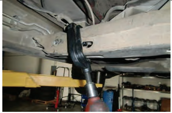
Reinstall tool and adjust upward enough to insert adj. block