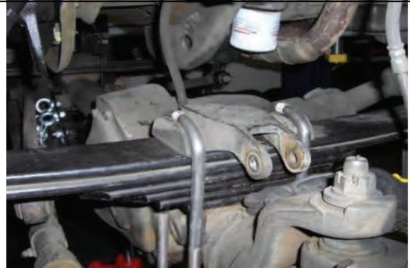
Replace spring plate with new longer U-bolts