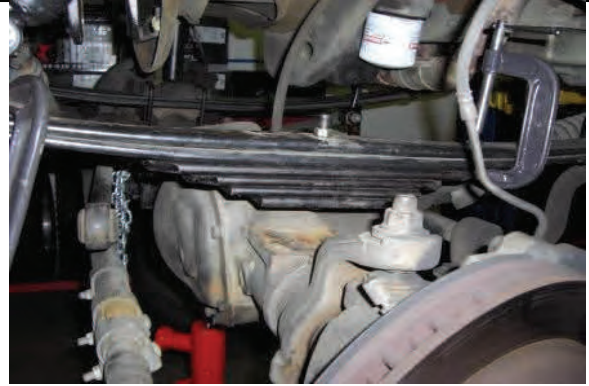
Tighten new leaf stack to OE leaves with provided nut