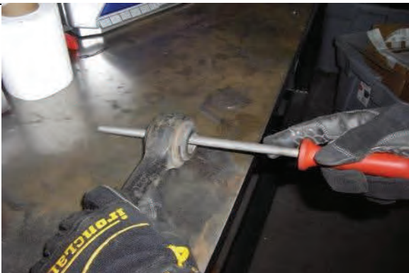
On both ends of the trac bar use a file to smooth inner sleeve