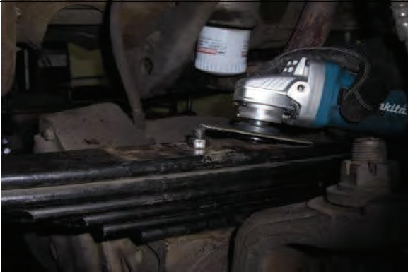
Grind excess threads to allow proper fitment of spring plate