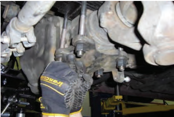
Attach lower spring plate with new hardware and tighten