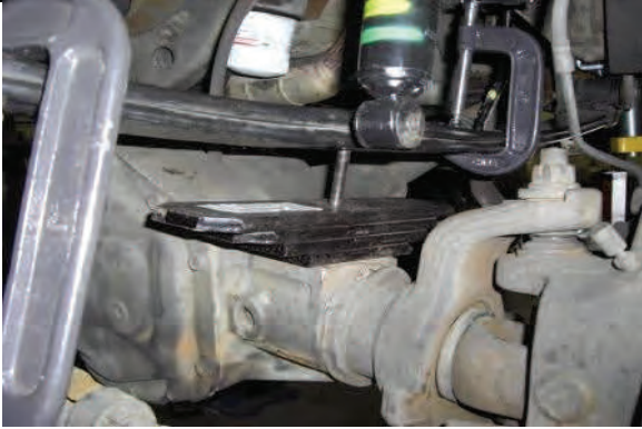
Remove nut from new center bolt and place into position