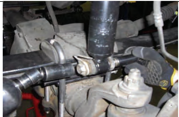
Reinstall lower shock into original position with OE hardware